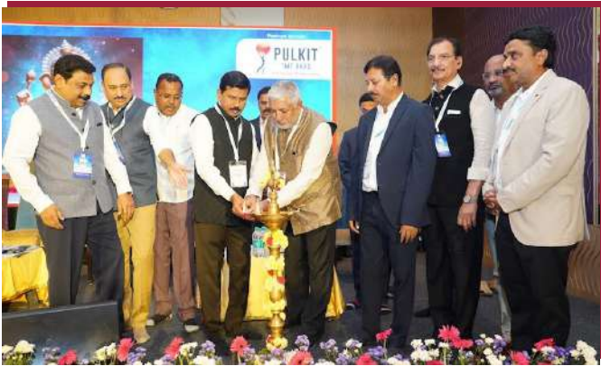
Lamp Lighting Ceremony