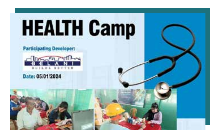
A health camp was organised by CREDAI Bengal members

A Health Camp was organized on January 5, 2024, at the Sanctuary project by CREDAI Bengal members in collaboration with the Belani Group and NPR Developers.