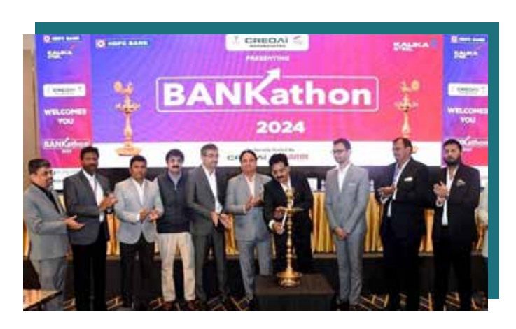
2nd General Body Meeting and Bankathon held in Mumbai

On January 5th, 2024, the second General Body Meeting and an exhilarating Bankathon held in Mumbai. The event brought together a diverse group of individuals, fostering an atmosphere of collaboration and innovation. During the meeting, members engaged in thoughtful discussions, contributing their perspectives to shape the future direction of the organization. Simultaneously, the Bankathon, a dynamic and fast-paced event, captivated the audience's attention. It showcased the prowess of talented individuals and teams as they raced against the clock to develop innovative solutions to challenges within the banking.