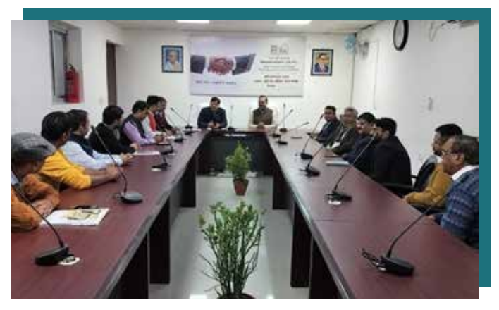
UP RERA Meet

On December 14th, a delegation from the Western U.P. Chapter of CREDAI NCR met with the Secretary of UP RERA. During the meeting, they briefed on strategies for the success of conciliation proceedings.