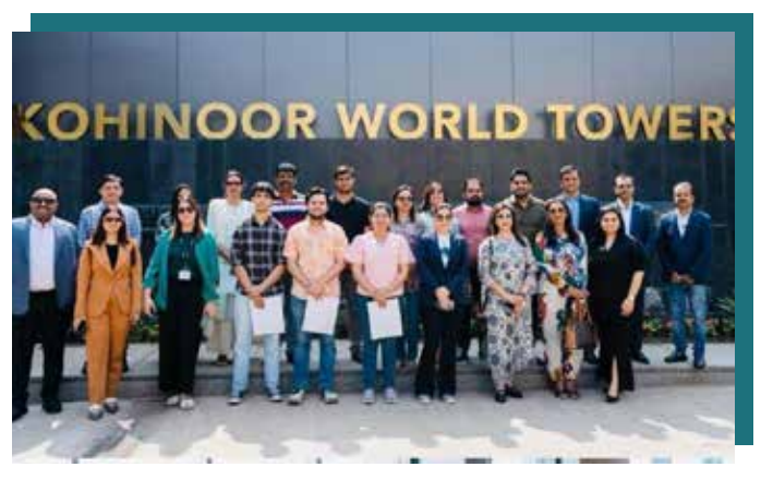
Study Tower to Kohinoor world towers

On January 5th, 2024, the second General Body Meeting and an exhilarating Bankathon held in Mumbai. The event brought together a diverse group of individuals, fostering an atmosphere of collaboration and innovation. During the meeting, members engaged in thoughtful discussions, contributing their perspectives to shape the future direction of the organization. Simultaneously, the Bankathon, a dynamic and fast-paced event, captivated the audience's attention. It showcased the prowess of talented individuals and teams as they raced against the clock to develop innovative solutions to challenges within the banking.