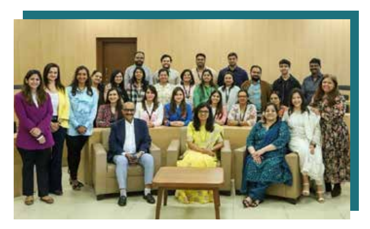
The first batch of the Real Estate Business Enhancement Certificate Course celebrated its culmination ceremony

The session covered construction insights, challenges, budgeting, marketing, and commercial strategies for their 10 lakh square feet commercial premises completed in just 25 months.