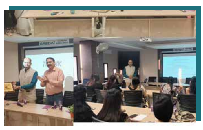
CWW Chatrapati Sambhaji Nagar, successfully hosted an insightful event

The session, delving into mind mapping and the profound power of the subconscious mind, provided a fresh perspective and left participants inspired.