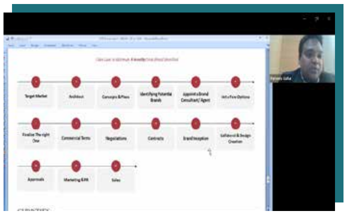
CWW Masterclass on Branded Residences

The project includes personalized orientation sessions, consultations with a Gynaecologist and General Physician, and the distribution of free medical kits comprising essential items and medicines among the Women Workers.