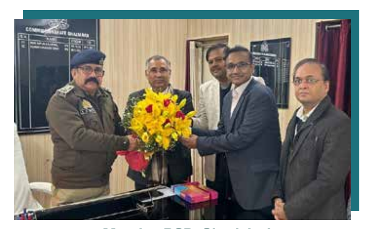
Meeting DCP, Ghaziabad

Recognizing the significance of these challenges and their potential implications for the broader real estate industry, the Board Members actively engaged in identifying effective solutions.