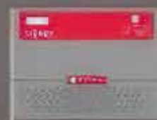
COMPACT CONTROL PANEL