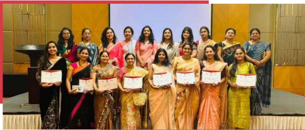
Winners at the CWW Vlog Competition

CREDAI Women's Wing, Belagavi, organized a Vlog competition with the theme "Vridhhi," symbolizing growth. The competition aimed to encourage women to visit construction sites, expand their industry knowledge, and actively engage in the construction sector. Participants created videos to market their projects, showcasing unique features and amenities. The judging criteria included their presence, confidence, the quality of site information, and overall presentation.