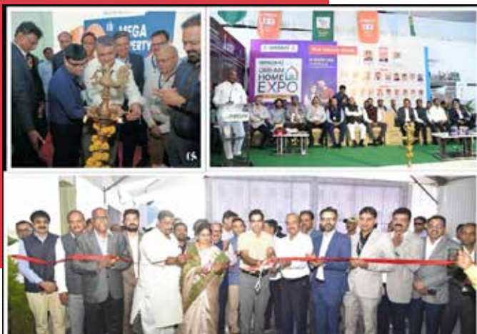
Glimpse of the property expos organised throughout the month

Additionally, the CREDAI Nashik Metro chapter organized a Property Expo from October 26 to 30, 2023, which received an enthusiastic response from customers across the city.