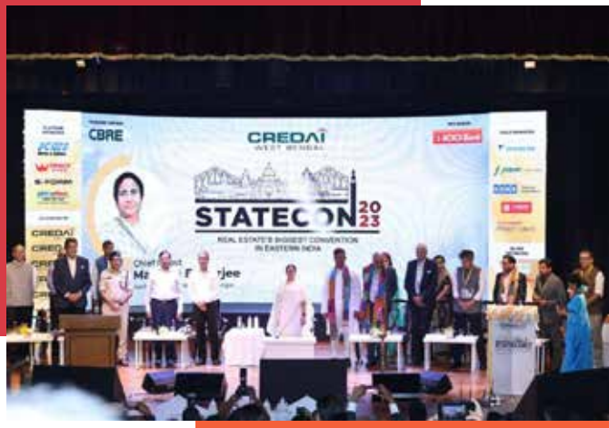
Hon'ble CM West Bengal, Mamata Banerjee at the Statecon