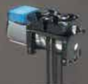
ITALIAN MBL BELT TECHNOLOGY

Join us as a franchisee and be part of our global success story.