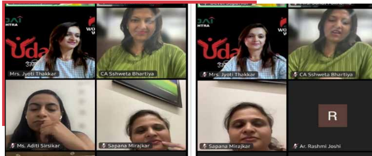
CWW organized 3rd session of Udaan 2.0

CREDAI Women's Wing, Belagavi, organized a Vlog competition with the theme "Vridhhi," symbolizing growth. The competition aimed to encourage women to visit construction sites, expand their industry knowledge, and actively engage in the construction sector. Participants created videos to market their projects, showcasing unique features and amenities. The judging criteria included their presence, confidence, the quality of site information, and overall presentation.