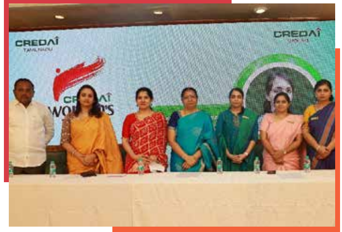
Opening ceremony of CWW Madurai Chapter

CREDAI Women's Wing hosted "World Green Building Week" from September 11th to 15th, 2023. The event saw more than 400 participants and featured knowledge sessions promoting sustainability. The week aimed to raise awareness, share insights, and drive action towards a greener, more sustainable future in the building industry.