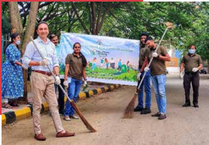
Cleaning drive organised by Prestige Group