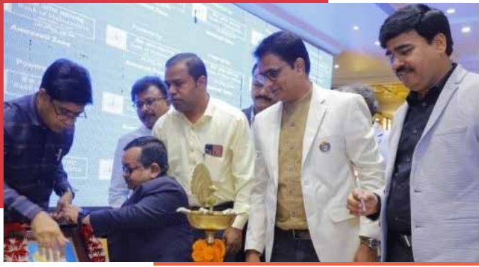
Best Building Awards organized by CREDAI Amravati

CREDAI Amravati organized its 13th consecutive Best Building Awards in 2023, attended by prominent figures, bank representatives, and a large group of CREDAI members. The competition featured 18 participants who embarked on a 12-hour-long journey during site visits.