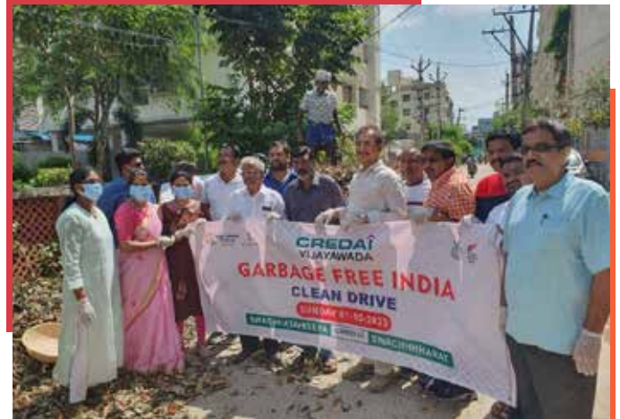
CREDAI Vijayawada organised a clean drive

CREDAI collaborated with the Ministry of Housing and Urban Affairs to align with the vision of a 'Garbage Free India,' in resonance with the Hon'ble Prime Minister's Call to Action. This initiative urged for 1 hour of shramdaan for Swachhata, paying homage to Bapu on his Jayanti.