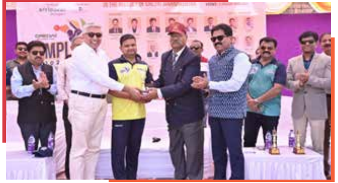
CREDAI-Maharashtra Premier League Cricket Tournament - Regional Round