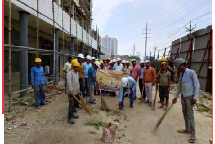
CREDAI NCR organized a clean drive of the surrounding areas