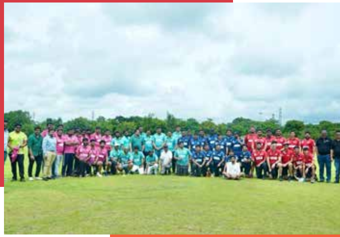
CYW organised its first-ever zonal sports meet