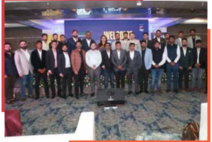
CREDAI members at the regional meet held in Nagpur