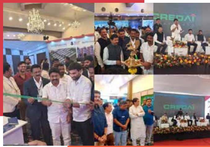
Glimpse of CREDAI Vijayawada Property Show

The CREDAI Vijayawada Chapter hosted a Property Show from October 21st to 23rd, 2023, featuring over 75 stalls.