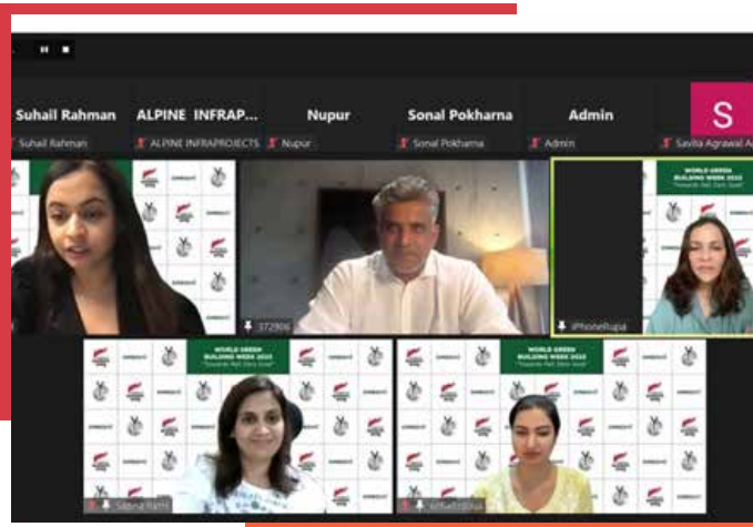
World Green Building Week hosted by CWW

CREDAI Women's Wing hosted "World Green Building Week" from September 11th to 15th, 2023. The event saw more than 400 participants and featured knowledge sessions promoting sustainability. The week aimed to raise awareness, share insights, and drive action towards a greener, more sustainable future in the building industry.