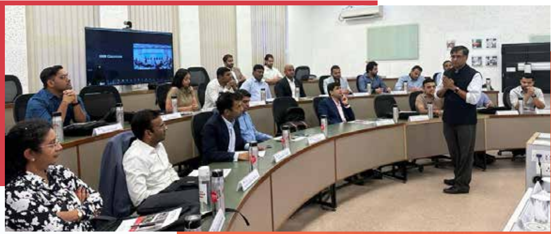
Candidates attending the Inaugural session

India's real estate sector is undergoing a crucial transformation, driven by factors like RERA, corporate involvement, and technology. CREDAI's collaboration with IIM Bangalore for the Business Leadership Programme recognizes the need for leaders to adapt to this changing landscape. In its 9th cohort for 2023-24, the program equips real estate leaders with essential tools to navigate the evolving industry, fostering continuous learning, strategic decision-making, and self-awareness.