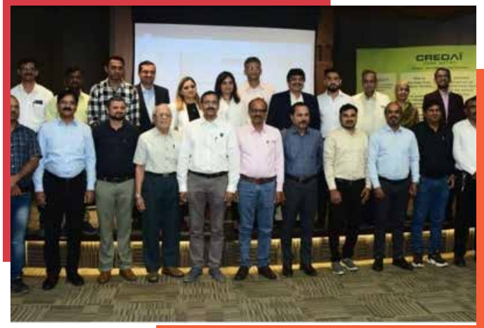
Members of CREDAI Labour Welfare Committee

CREDAI Pune Metro organized a special event to announce the Groundbreaking Safety Award Competition 2023 and the Best Facility Award Competition 2023. These competitions are a testament to our members' unwavering dedication to workforce safety and real estate excellence.