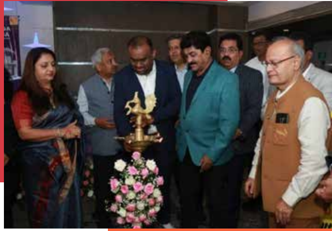
CYW & CWW organised a regional meet in Nagpur