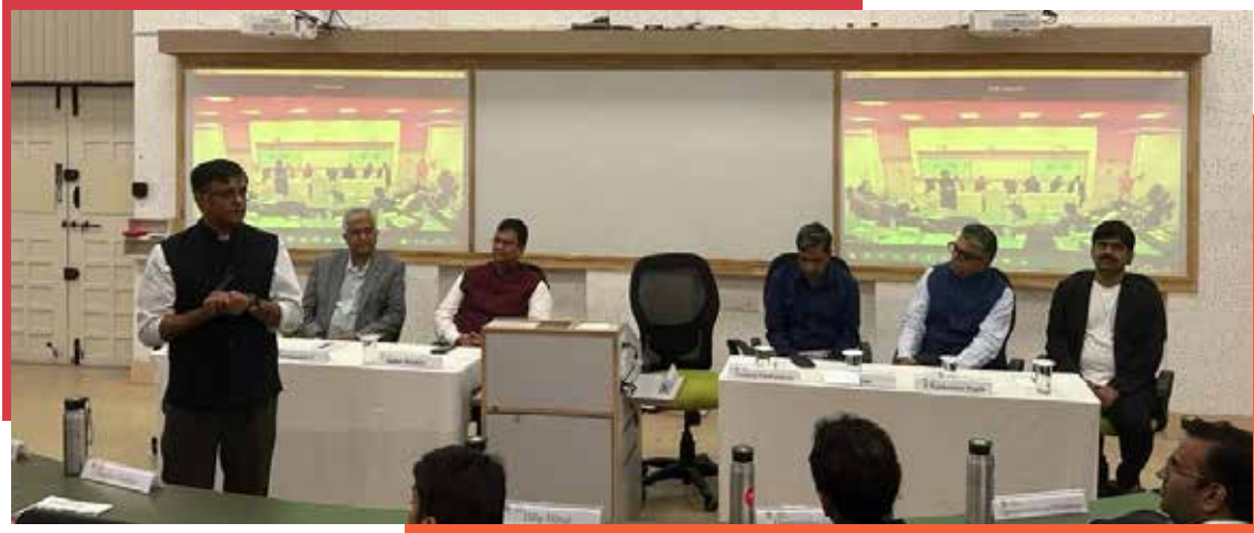
Inaugural session of CREDAI IIMB