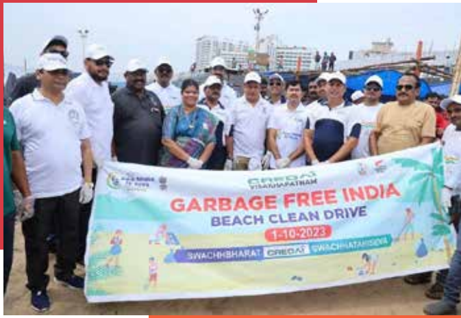
CREDAI Visakhapatnam organised a beach clean drive