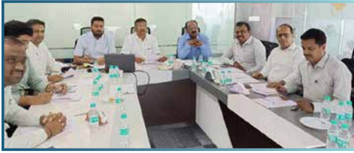
CREDAI Maharashtra 1st OB meeting

The 1st Office Bearers' Meeting was held on 3rd April at the CREDAI Maharashtra Office, marking the beginning of a new chapter of collaborative leadership and focused planning for the year ahead.