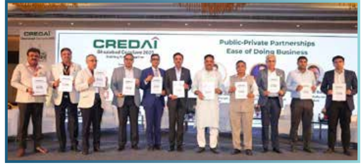
CREDAI Ghaziabad chapter releases white paper for urban transformation

The Minister assured full support and emphasized Ghaziabad's role in the Viksit Bharat mission. The meeting reinforced CREDAI Ghaziabad's commitment to collaborative, growth-oriented engagement with the government.