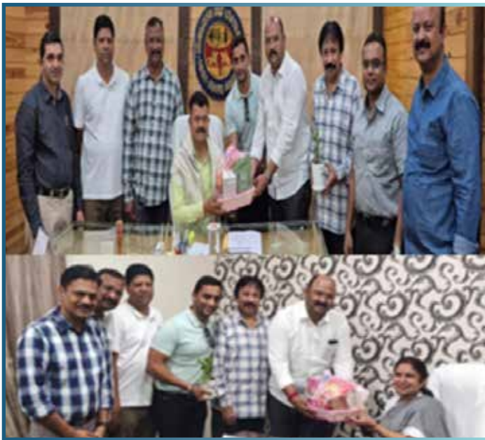
CREDAI Belagavi felicitated Mayor and Deputy Mayor

This mega event was graced with the presence of Hon'ble Dy. Chief Minister of Karnataka, Sri. D K Shivakumar and Hon'ble Speaker of the Karnataka State Assembly, Sri. U T Khader and many more dignitaries.