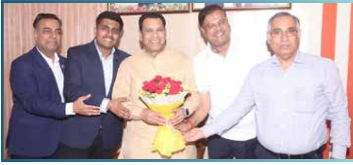
CREDAI NCR (Ghaziabad) delegation met state minister to discuss regional issues

On April 19, 2025, a delegation from CREDAI NCR – Ghaziabad Chapter met Hon'ble State Minister Shri Narendra Kashyap to discuss key issues impacting the region's real estate sector. Topics included infrastructure, regulatory approvals, and the need for better coordination with local authorities.