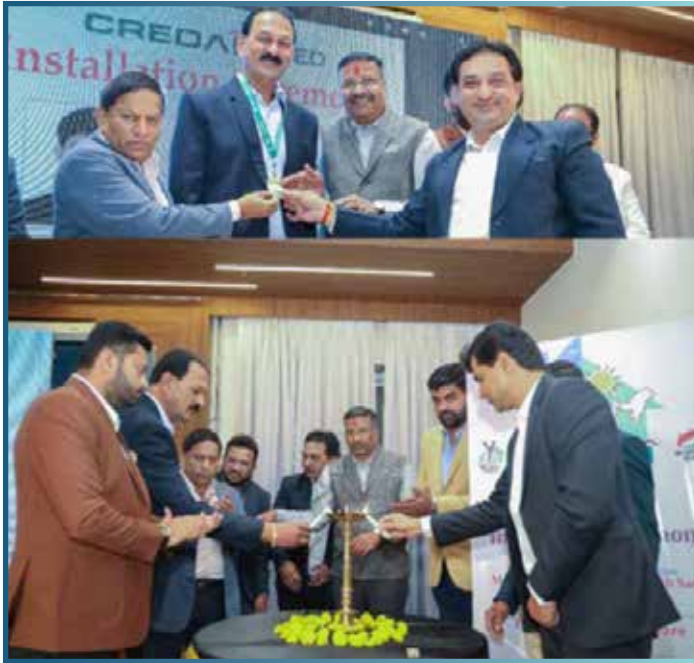
CREDAI-Beed Installation Ceremony