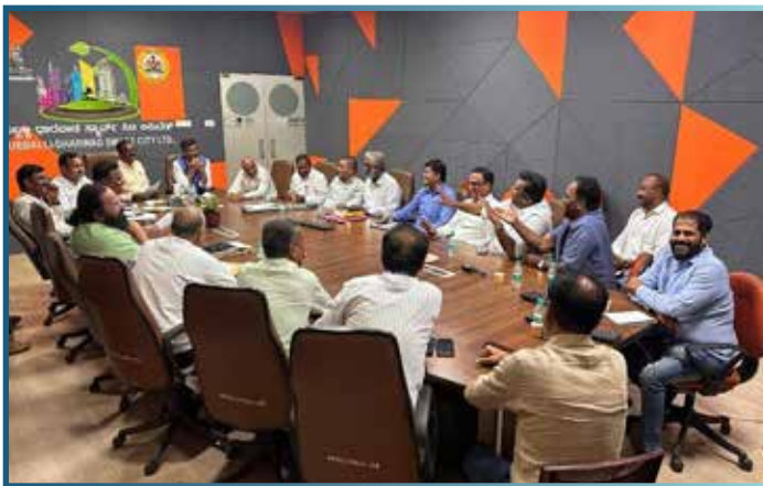
CREDAI Hubli & Dharwad Holds Joint Meetings with Government Departments on Key Urban Development Issues

The discussions focused on strengthening collaboration, addressing key regulatory matters, and exploring ways to improve welfare measures for construction workers in the region.