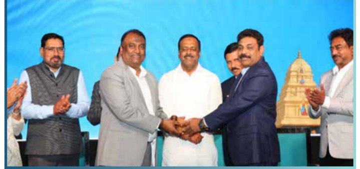
CREDAI Karnataka organised AGM and Change of Guard Ceremony