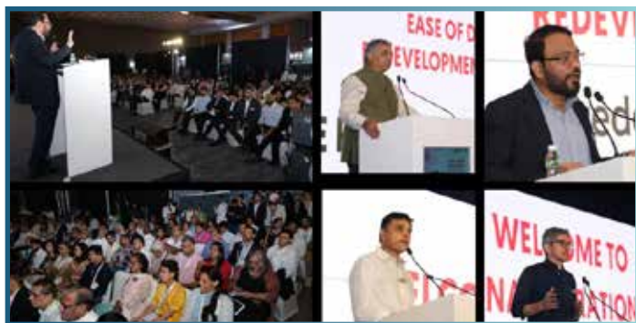
2nd Edition of CREDAI MCHI's redeveloping Mumbai 2025

CREDAI-MCHI also acknowledges the encouraging progress in the Girni Kamgar housing scheme, upcoming key distribution events in Naigaon, Worli, and Ghodapdeo, and the Konkan Board's readiness with 3,000 homes and plans for 7,000 more. MHADA's proposed rental housing for senior citizens, women, and students highlights its inclusive vision for housing development.