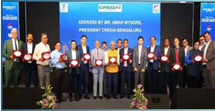
Annual General Meeting of CREDAI Bengaluru

CREDAI Bengaluru AGM and Change of Guard Ceremony took place on 14th April 2025 at Hotel Conrad, Bengaluru.