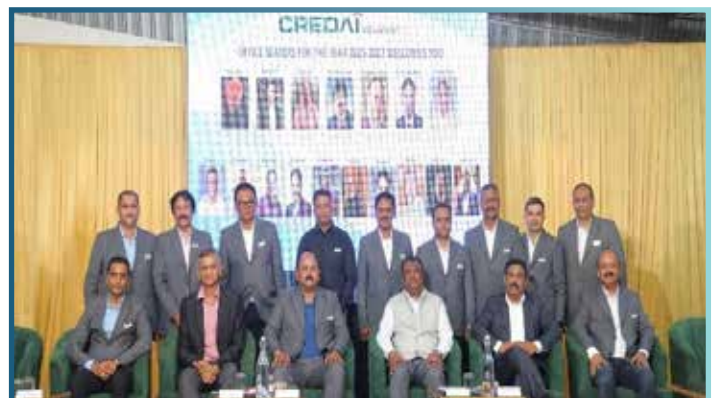
Installation Ceremony of CREDAI Belagavi

On 4th April, the CREDAI Belagavi team felicitated the Mayor and Deputy Mayor and held discussions on key civic concerns, including the E-Asthi process and challenges related to perpetual lease agreements.