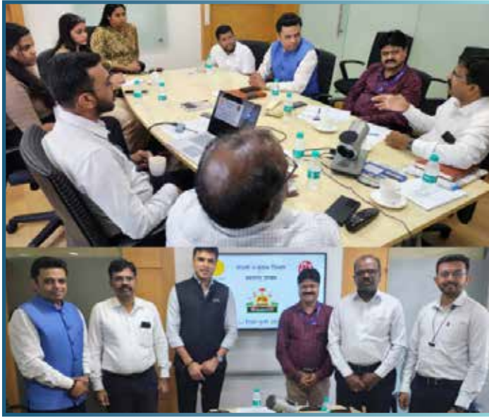
CREDAI-MCHI organised a meeting

CREDAI-MCHI organized a meeting on April 9, 2025, at its office to deliberate on the implementation of the 100-day action plan focused on accelerating financial and industrial investment in the region.