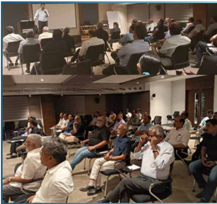
Annual General Body Meeting held at House of CREDAI, Kochi