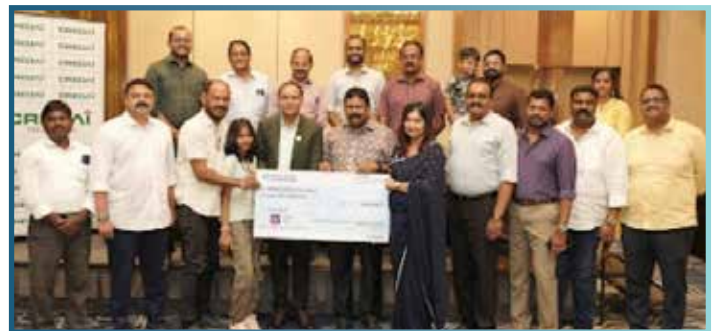
Lucky draw of CREDAI Property Expo held at Hyatt

Members discussed ongoing developments, reviewed progress, and explored new strategies for enhancing the real estate sector in Kochi.