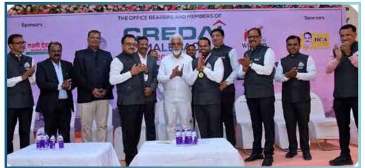
Installation ceremony of CREDAI-Malegaon

The Expo witnessed participation from over 40 developers from Sindhudurg and Ratnagiri, showcasing the region's growing real estate potential.