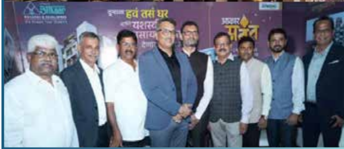
Konkan Property Expo