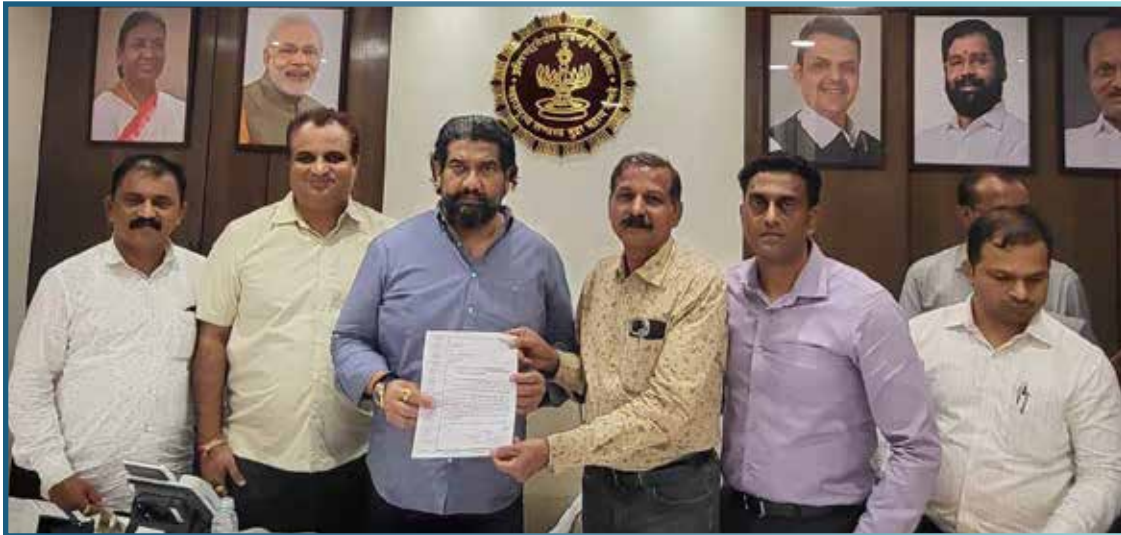
CREDAI Kolhapur members meeting with PWD minister