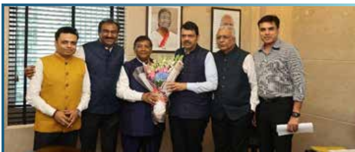
Meeting with Shri Devendra Fadnavis, Hon'ble Chief Minister of Maharashtra

The discussion centred around collaborative efforts to streamline processes and strengthen the ecosystem for increased investment activity.