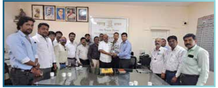
CREDAI Karad welcomed newly appointed Municipal C.E.O

Key agendas were discussed, setting a clear direction for CREDAI Maharashtra's initiatives and activities.