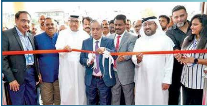
10th Edition of the Kerala Property Expo

On 25th and 26th April, CREDAI Kerala members actively participated in the 10th Edition of the Kerala Property Expo, organized by Mathrubhumi.com, held at the Bahrain Keraleeya Samajam in Bahrain