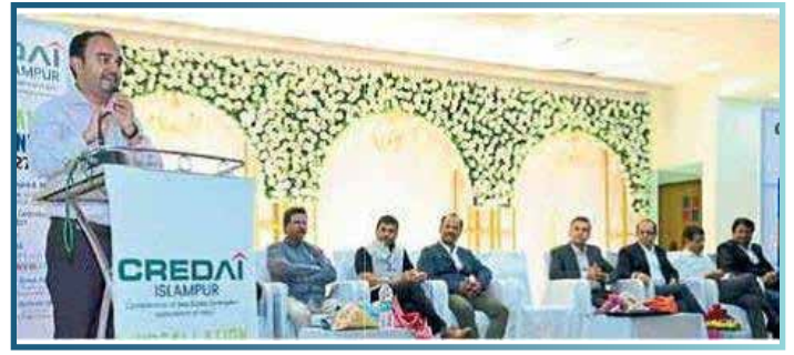
CREDAI-Islampur Installation Ceremony