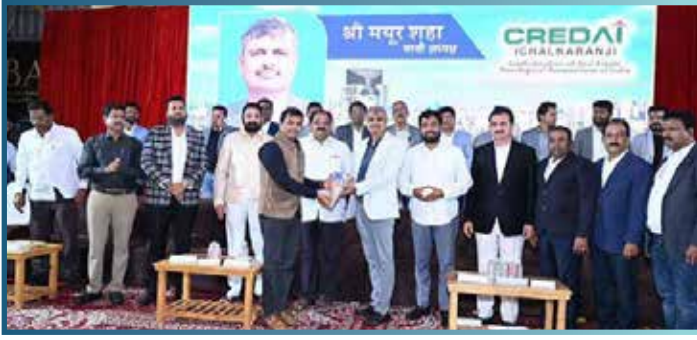
CREDAI Ichalkaranji Installation Ceremony