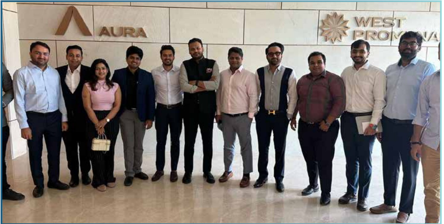
CREDAI Youth Wing first OB meeting

CREDAI Youth Wing successfully conducted its first Office Bearers (OB) meeting for the tenure 2025-27 on 19th April in Ahmedabad.