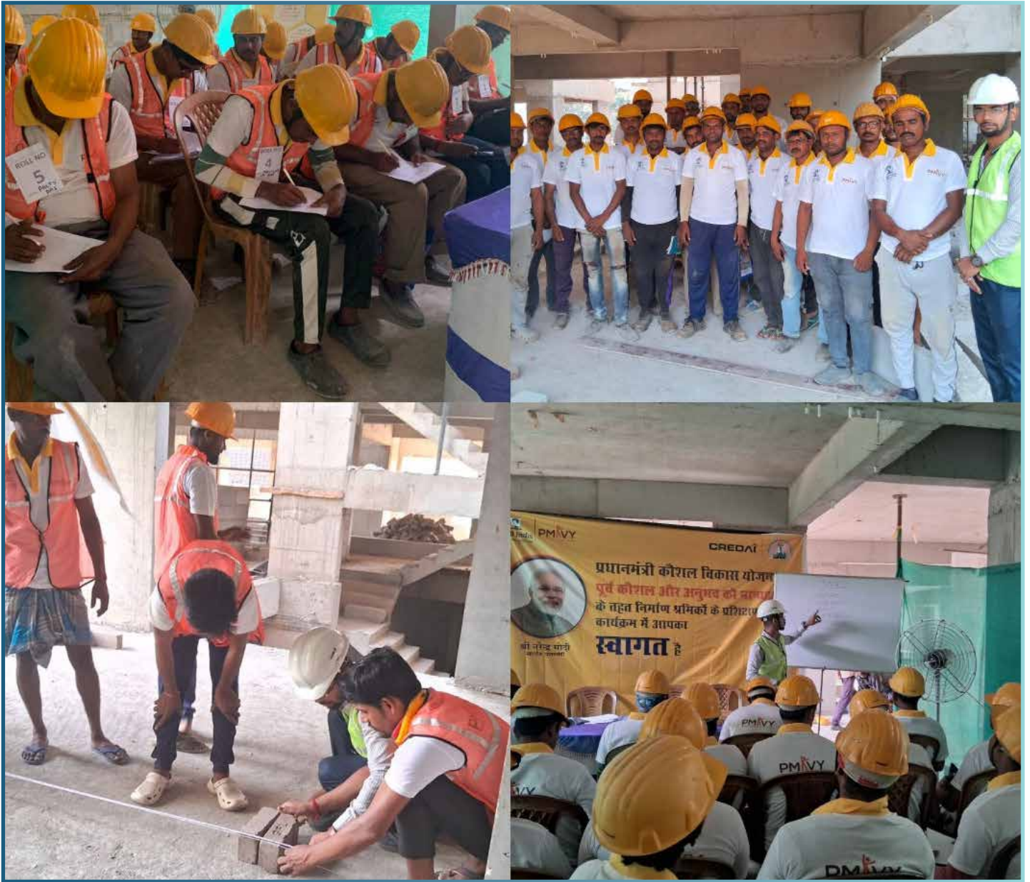
Recognition of Prior Learning (RPL) Skill Training Programme conducted by CREDAI Bengal

CREDAI Bengal continues its' commitment to enhance the skills and capabilities of construction workers in the region. In April 2025, the Recognition of Prior Learning (RPL) Skill Training Programme, was successfully conducted at the site Navya, developed by Super Diamond Nirman Pvt Ltd,