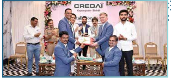
Installation Ceremony of CREDAI Kopergaon-Shirdi