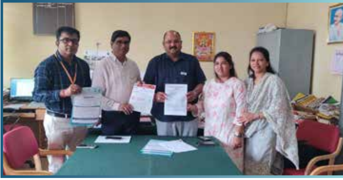
CREDAI Belagavi & CWW members meeting with Labour department officials

On 24th April 2025, the CREDAI Belagavi team, along with members of the CREDAI Women's Wing (CWW), held a meeting with officials from the Labour Department.