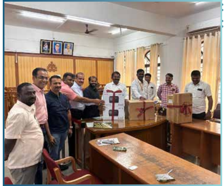
CREDAI Hubli & Dharwad Contributes IT Equipment to Tahsildar Office Under CSR Initiative

The discussions focused on critical urban development matters such as layout handover procedures, building permission processes, issuance of NOCs for water and drainage connections, and approvals for apartment projects on amalgamated plots, etc.