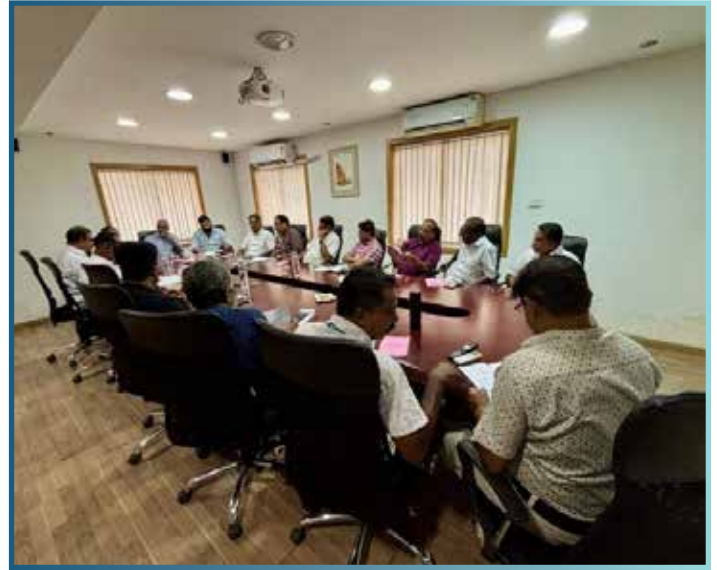
CREDAI Kochi meeting with BAI

On 25th and 26th April, CREDAI Kerala members actively participated in the 10th Edition of the Kerala Property Expo, organized by Mathrubhumi.com, held at the Bahrain Keraleeya Samajam in Bahrain