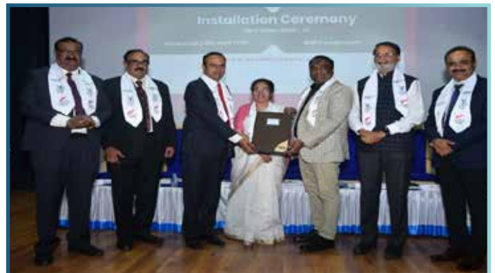
CREDAI Mysuru Installation Ceremony

On 5th April 2025, as part of its CSR initiative, the CREDAI Hubli & Dharwad team donated computers, printers, and scanners to the Tahsildar Office, supporting efforts to enhance administrative efficiency and public service delivery.