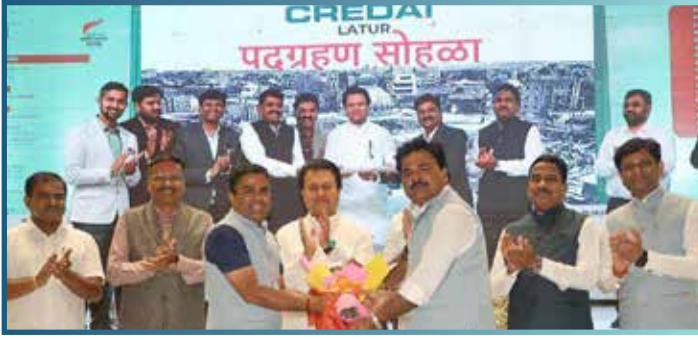
CREDAI-Latur Installation Ceremony