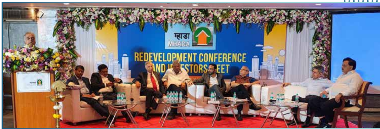
MHADA redevelopment conference & investment meet

The MHADA Redevelopment Conference and Investment Meet held on April 28, 2025, marked a pivotal step in advancing public-private collaboration to deliver 8 lakh homes across MMR, with a strong focus on affordable housing for EWS to MIG categories. We applaud MHADA's proactive initiatives, including the use of 2.5 FSI and fast-tracked redevelopment at Motilal Nagar, GTB Nagar, Sindhi Society, PMGP Jogeshwari, and seven cluster projects in Prabhadevi—reinforcing its commitment to sustainable urban growth.