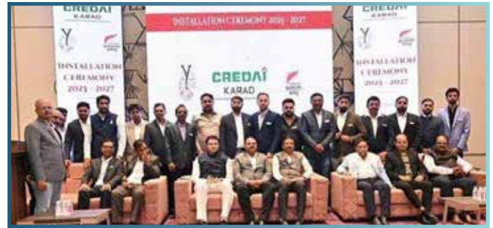
Installation Ceremony of CREDAI-Karad