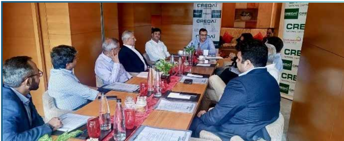
CREDAI NCR – Haryana zonal chapter holds EC and GC meeting

Emphasizing collaboration between government, developers, and stakeholders, the White Paper serves as a call to action for shaping Ghaziabad into a national model for responsible urban development.