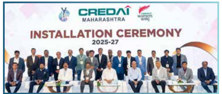
CREDAI Maharashtra Installation Ceremony