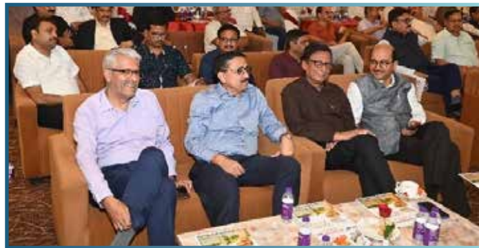
CREDAI Bihar Installation Ceremony