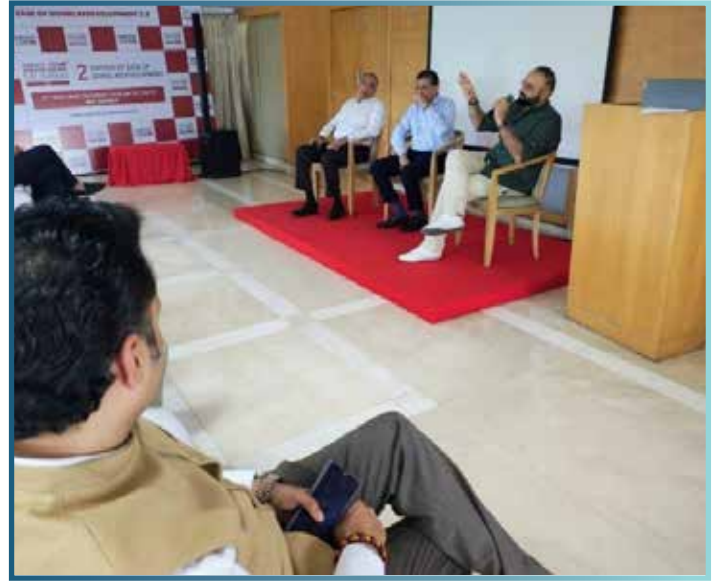
CREDAI-MCHI Hosts a Power-Packed Session on "Update on EC and NGT Bhopal Matter in MMR"

On Thursday, 10th April, CREDAI-MCHI successfully hosted an insightful session at its office under the Members Guidance Cell, focusing on the topic "Update on EC and NGT Bhopal Matter in MMR."