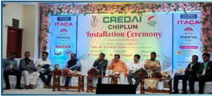
CREDAI-Chiplun Installation ceremony