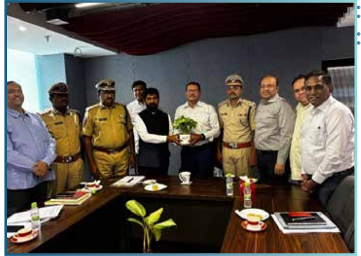
CREDAI Hyderabad Joins Stakeholder Meeting on BP-Connect Auto Scrutiny Engine

The discussion revolved around enhancing infrastructure, fast-tracking key development projects, and fostering greater collaboration between the government and the real estate sector to drive sustainable urban growth in the state.