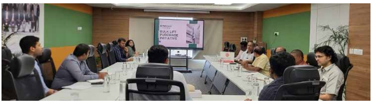
CREDAI Hyderabad hosted an exclusive bulk lift purchase meet

CREDAI hosted an exclusive bulk lift purchase meet, which brought together industry leaders and key decision-makers for an insightful and productive session.