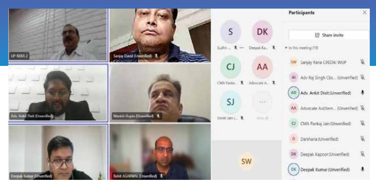
Conciliation proceedings of U.P. RERA

On 6<sup>th</sup> June, UP RERA organized conciliation meeting between Buyers and Developers. CREDAI NCR (Western U.P.) was represented by senior members and employees from the Secretariat.