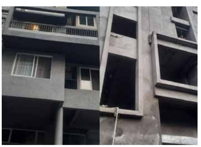
CWW Kolhapur organized a visit on Ashwamedh Construction site

CWW successfully held the orientation program for its First-Ever Mentorship Program on 27<sup>th</sup> June 2024. This innovative initiative is designed to empower CWW members through a unique one-on-one mentorship experience with leading experts in the real estate industry. The orientation program marked the beginning of a transformative journey for our inaugural batch of five outstanding mentees, carefully selected from numerous applications.