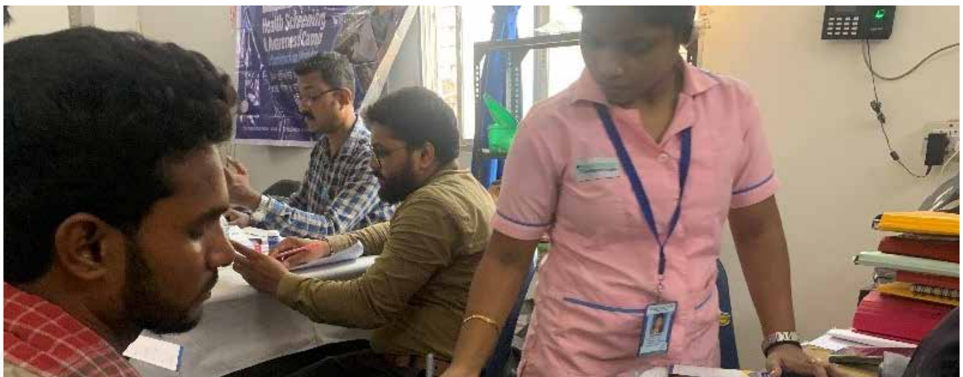
Health Camp organized by CREDAI Bengal members

CREDAI Bengal members, including Super Diamond Nirman Pvt Ltd, CFM Infratex Limited, Ideal Group, and Bengal Isha Infrastructure Private Ltd, organized a comprehensive health camp in multiple sites. The camp provided free medical check-ups, essential health screenings, and wellness advice to construction workers and their families. Over 250 workers were screened, receiving vital healthcare services and consultations from experienced medical professionals. This initiative aims to promote health awareness and ensure the well-being of the workforce.