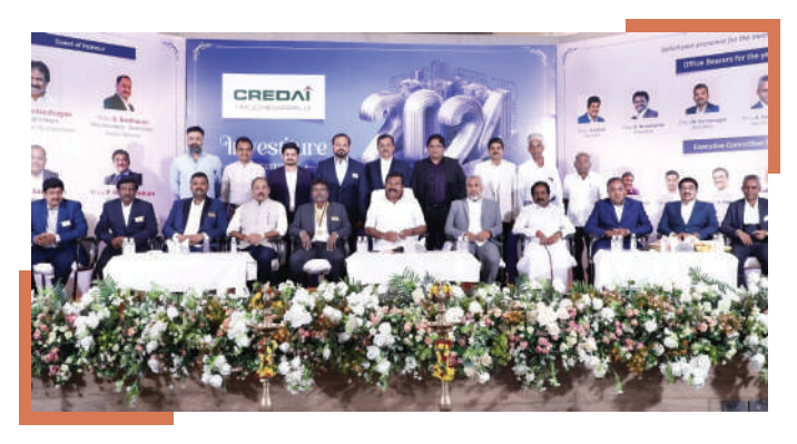
Investiture ceremony of CREDAI Tiruchirappalli

The Investiture Ceremony of CREDAI TIRUCHIRAPPALLI took place on April 27th, marking a significant milestone for the organization. The ceremony was graced by Hon'ble Minister of Municipal Administration, Government of Tamil Nadu, Shri. Thiru K.N. Nehru as a chief guest.