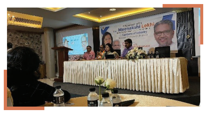
Ms. Meenakshi Lekhi, Hon'ble Minister of State for External Affairs and Culture of India, Gol, addressed the crowd during the session

An interactive session was organized with Ms. Meenakshi Lekhi, Hon'ble Minister of State for External Affairs and Culture of India, Govt of India along with key personnel of Kochi's Business Sector, held at Hotel Marine Inn to discuss Industrial matters.